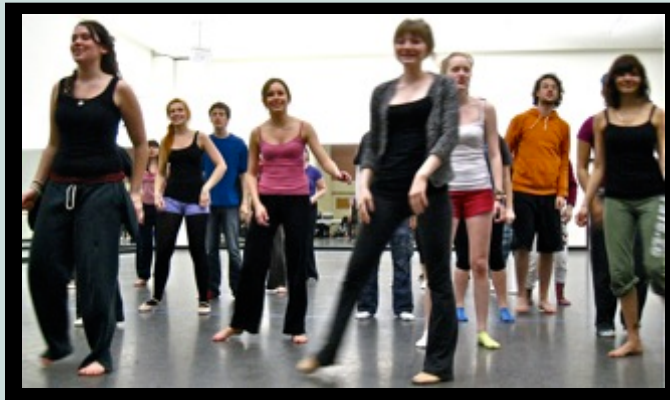
Theatre students pause for a picture while rehearsing scenes .